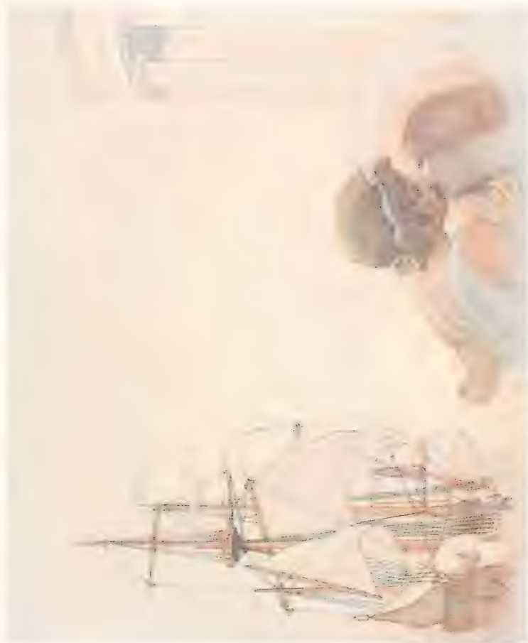
THE FAREWELL OF THE LOVERS